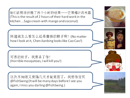
Figure 3: Image tweets with their corresponding text, image and translation. The top two are examples of visual tweets, and the bottom two are non-visual ones.

between emotional and general non-visual tweets is difficult – our annotation efforts showed that it may be more a continuum than a binary distinction. As such we only consider the binary distinction between visual and non-visual categories, although we feel it is interesting.