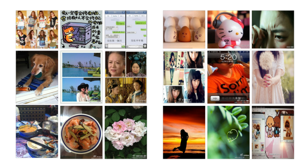
Figure 1: 18 Example Images from Image Tweets.

Two previous studies have attempted to answer this for the general domain. Marsh and White [6] identified 49 relationships, grouping them into three major categories based on the closeness of the relationship. Martinec and Salway [7] studied text-image relations from two perspectives: status (in terms of relative importance) and logico-semantic (one expands or repeats the same meaning of another). While